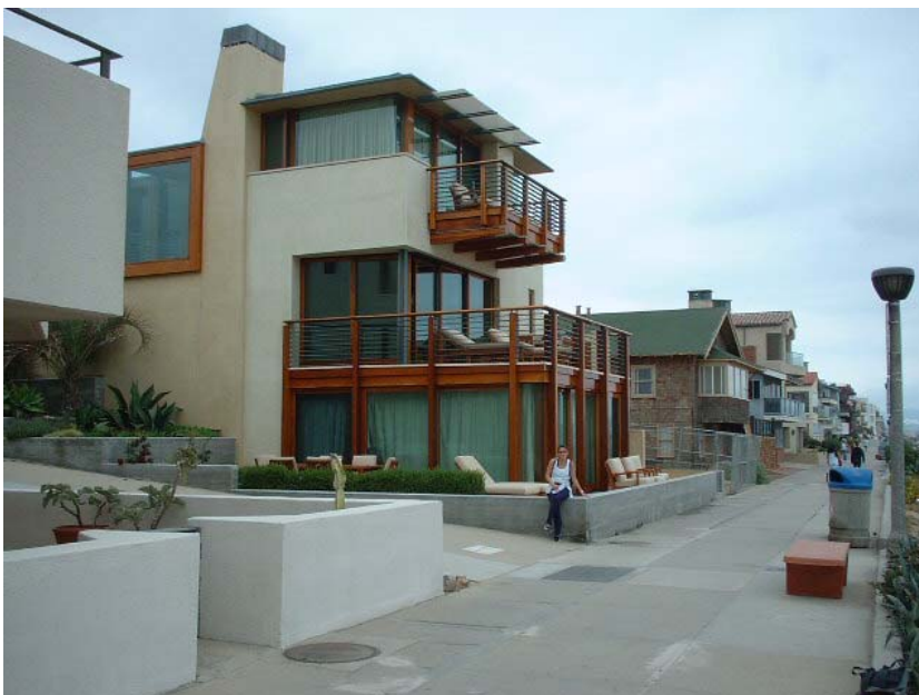
Missy sitting in front of our “dream house” on the Strand in Manhattan Beach